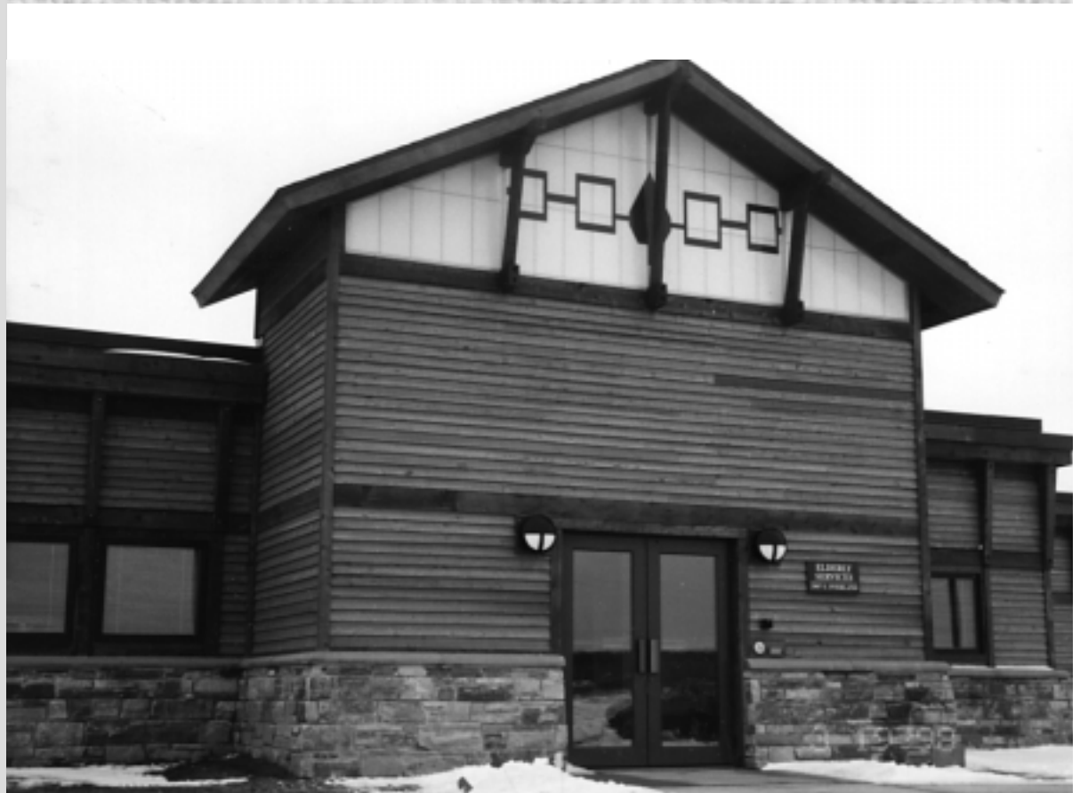
(Lee McLester II Building-Elderly Complex)