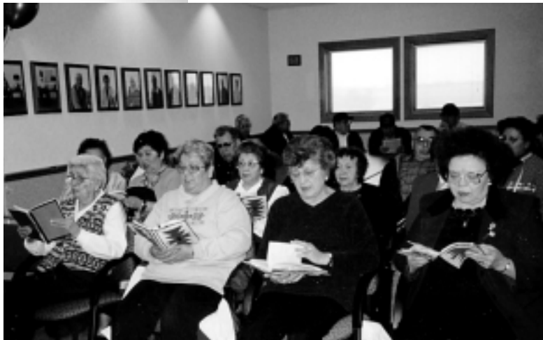
ONEIDA FAMILY- N6457 CT HWY H

Special Events are held throughout the year and are scheduled on a monthly calendar along with the Activities & Crafts for those elders who participate in the Senior Center meal site and have a Senior Center Enrollment form on file with our office. Events such as Spring Fling, Easter Dinner, Halloween Party, Elder Christmas Party, Birthday Parties, Breakfast Forums, Wisconsin Indian Elders Association meetings, National Indian Council On Aging Conference, and many more. Please call 869-2448 for more information on